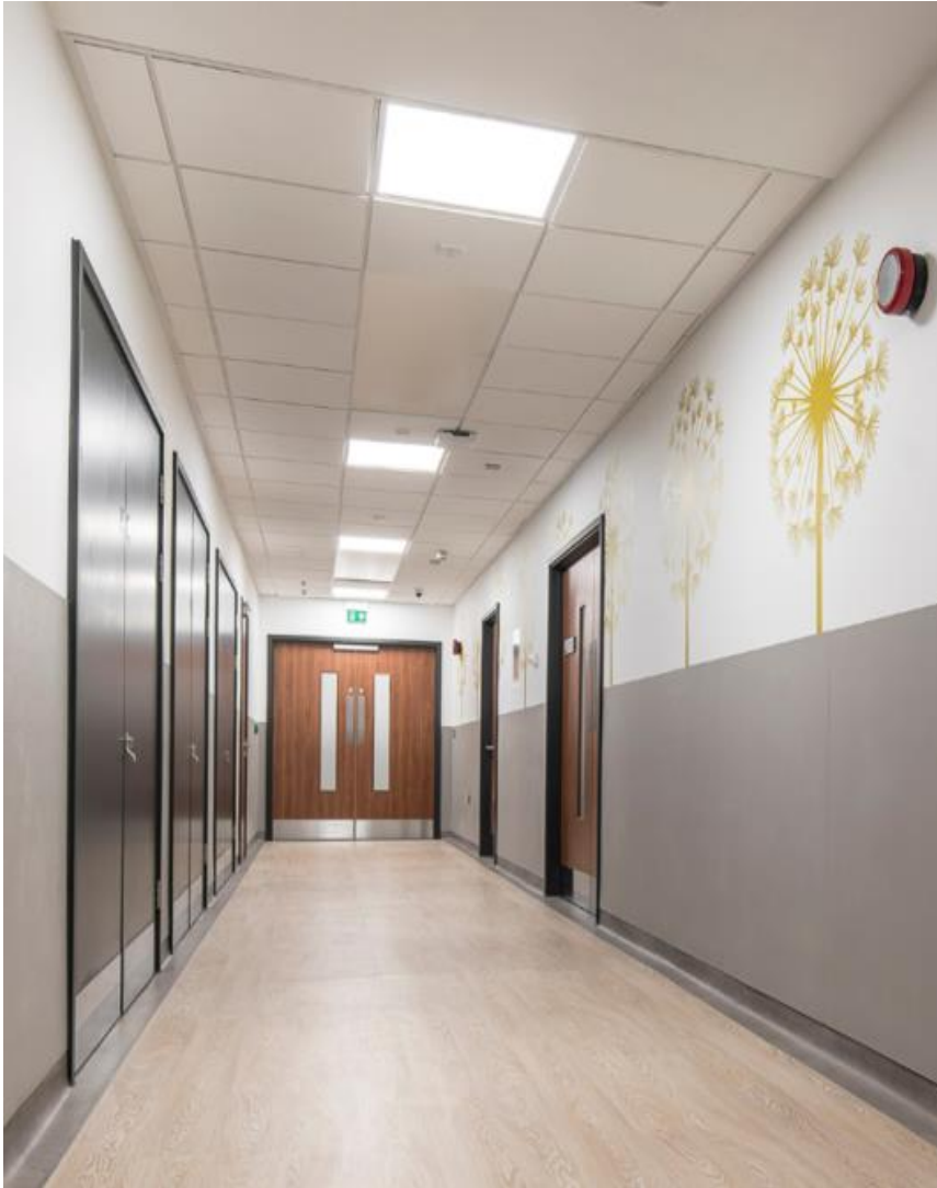
PVC wall cladding, protection, and decoration panels for inside walls

PVC CLADDING, PROTECTION AND DECORATION PANELS FOR INSIDE WALLS